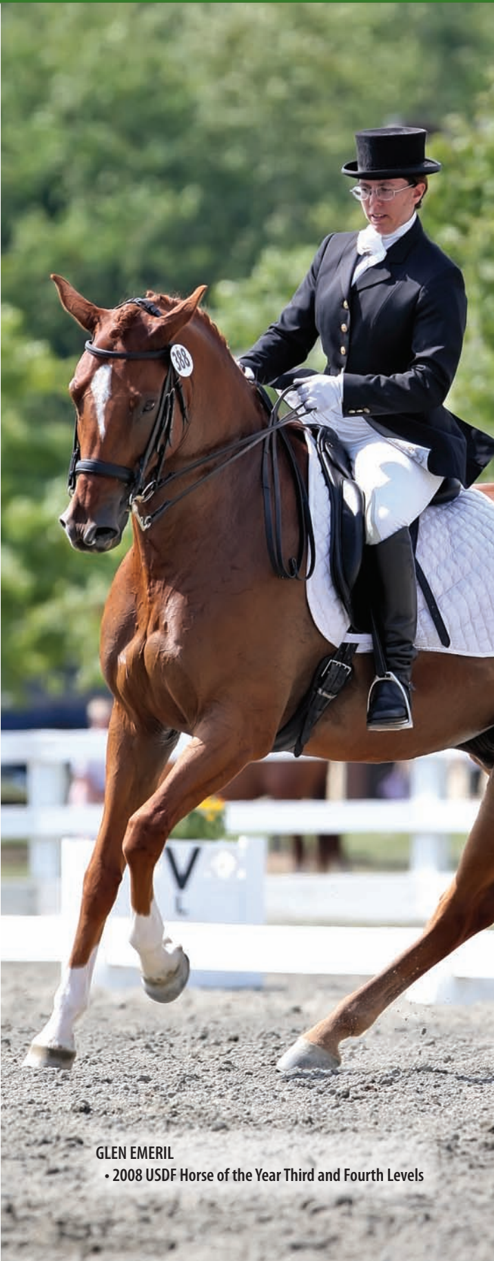
GLEN EMERIL • 2008 USDF Horse of the Year Third and Fourth Levels