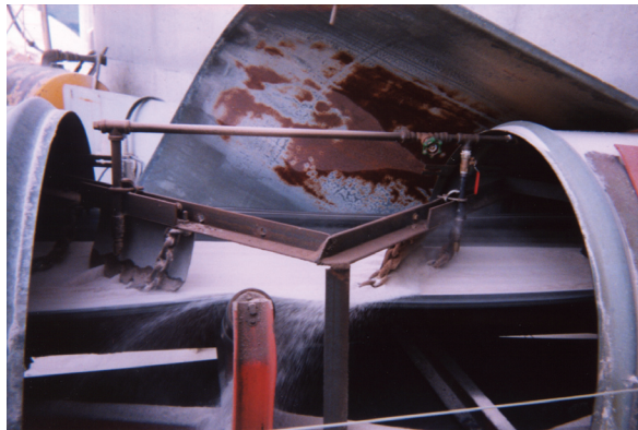
Blades and chain filtering SoKleen through sand.