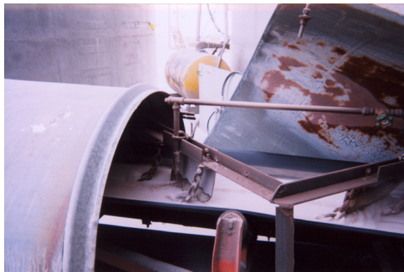
Treatment of sand with SoKleen to prevent harmful dust.