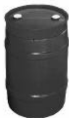
55 gallon drums