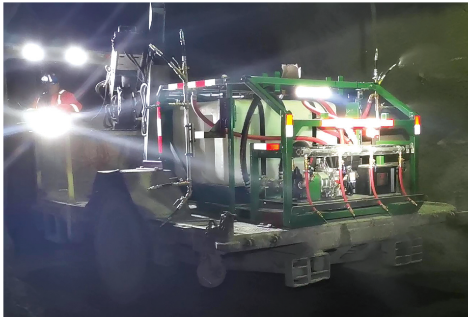
One mining operation mounts the MineKleen Underground Dust Control System to a 1-ton pickup.

"This system has been beneficial for everyone," Carpenter said. "We have received a lot of positive feedback." Midwest Industrial has implemented five MineKleen systems in underground mines during the first 12 months of the program.