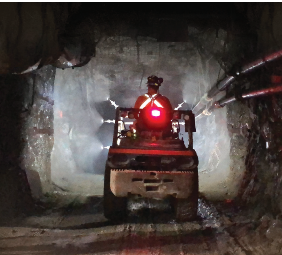
A miner uses a specially design system to apply a dust control product to the road, rib walls and the back.

The low humidity inhibited the use of water alone as a wetting agent. The mine was using lignosulfonates to control the dust and conditions were not