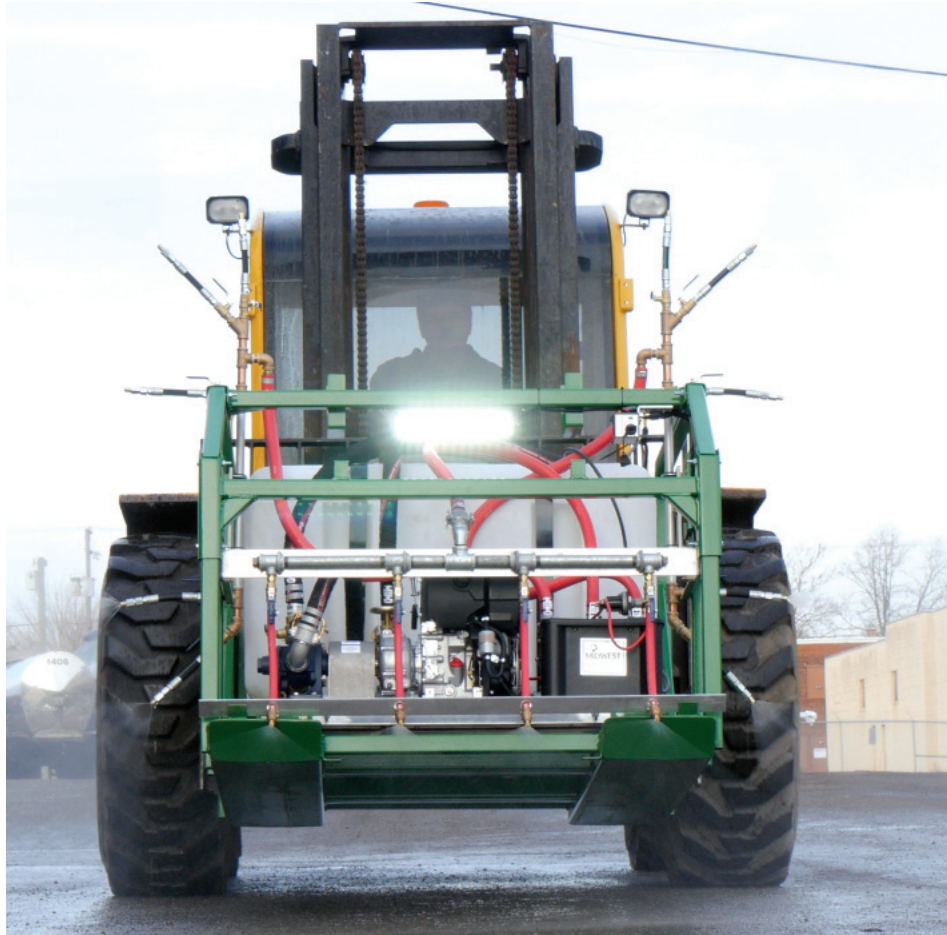
The applicator was designed for use underground and mounted on a forked skid.

"We needed a product that would help build the road in a way that would last longer than three days," Shaw said.