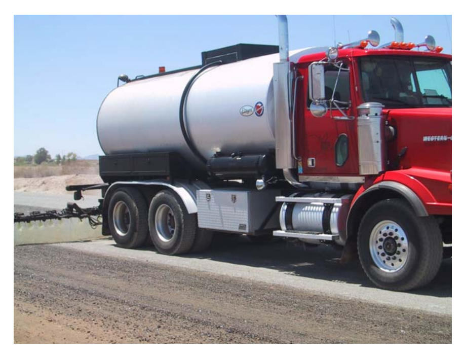
Figure 4. Application of EnviroKleen product at MC