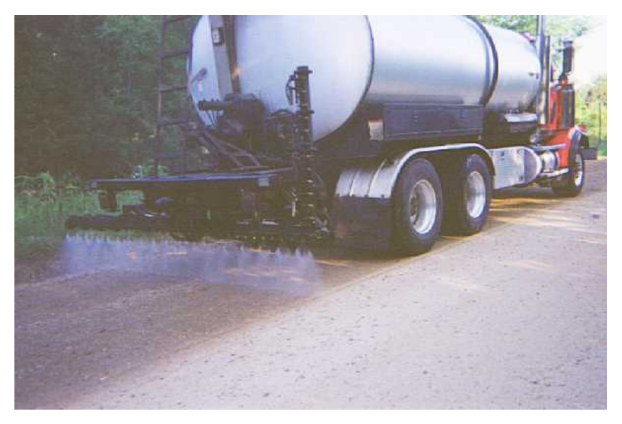
Figure 3. Application of EnviroKleen product at FLW