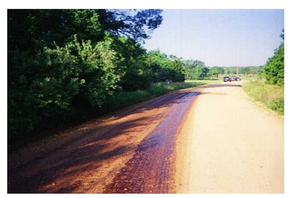
Figure 3. Application of EK35 product at FLW