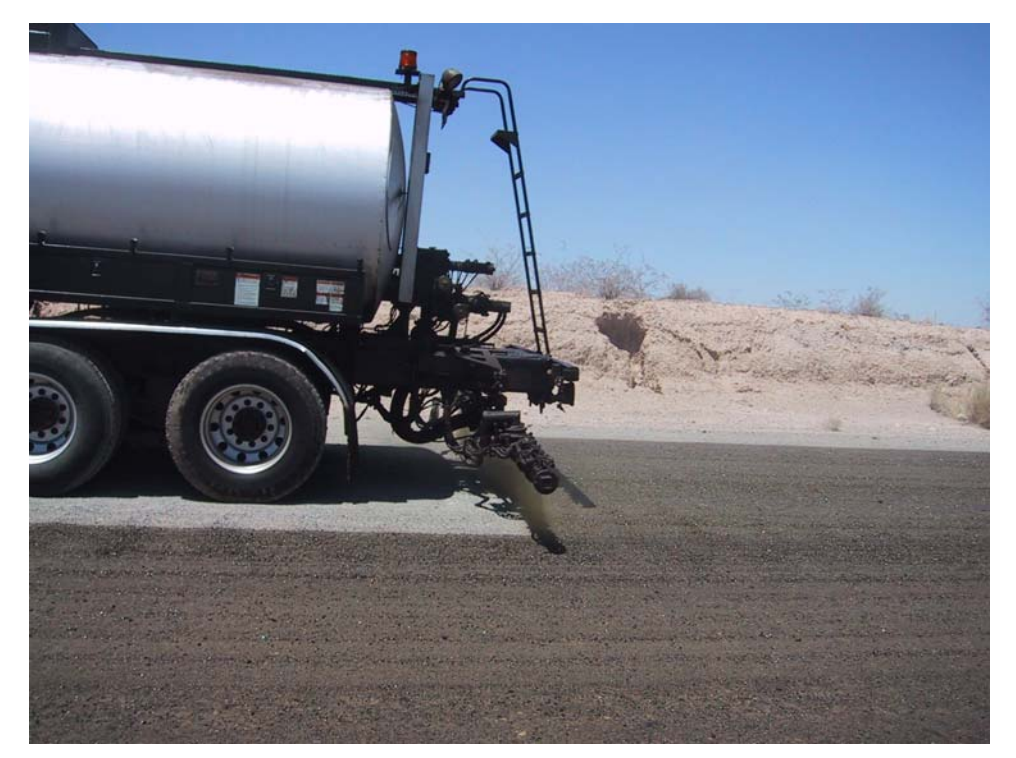
Figure 4. Application of EK35 product at MC