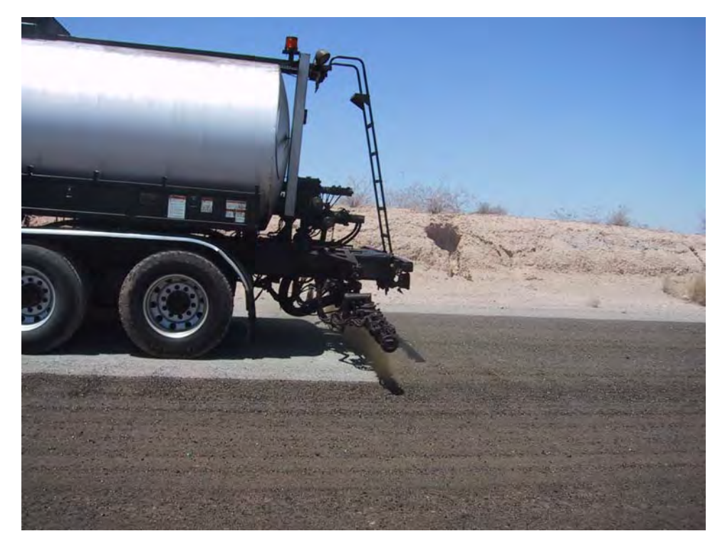
Figure 4. Application of EK35 product at MC