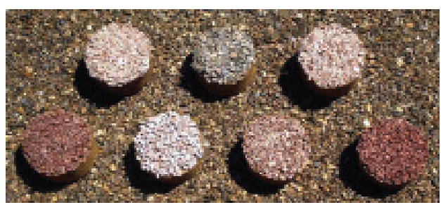
Eco-Pave Chip is available in a variety of natural colors.

Eco-Pave Chip® , a powerful binder covered with an aggregate – produces a natural, warm, visually-pleasing chip-sealed running surface.