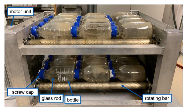
Figure 2: Rolling Bottle Test Setup

Midwest Industrial Supply, Inc. 1101 3rd Street Southeast Canton, Ohio 44707